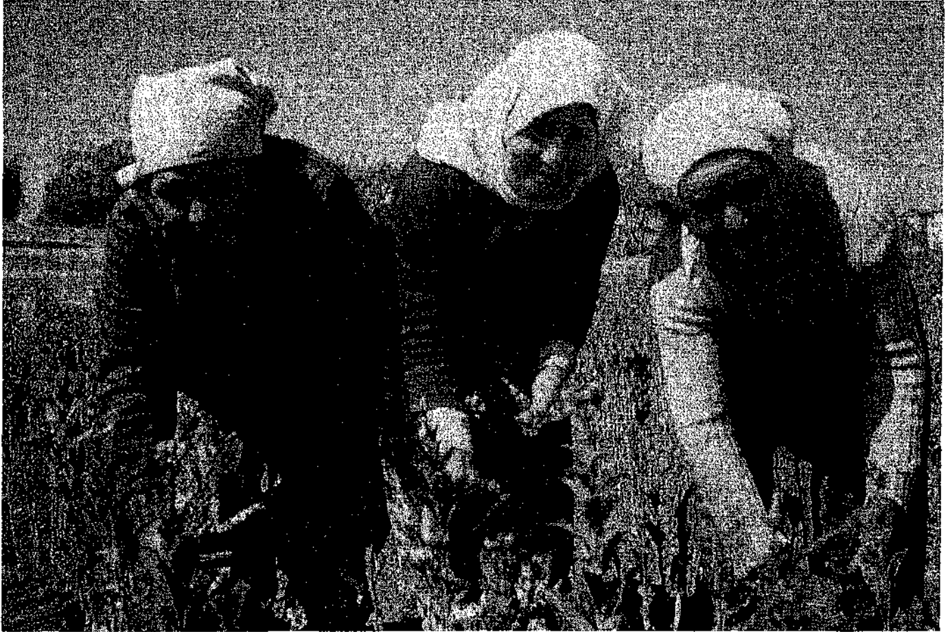
The growers' associations are demanding premiums for farmers as price increases do not cover the inflation rate.